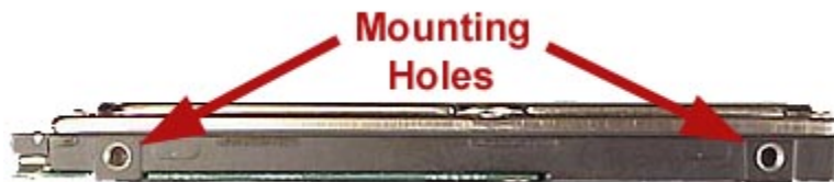
Figure 2.HDD Mounting Holes

Important Note: Disconnect power from your computer system before beginning installation.